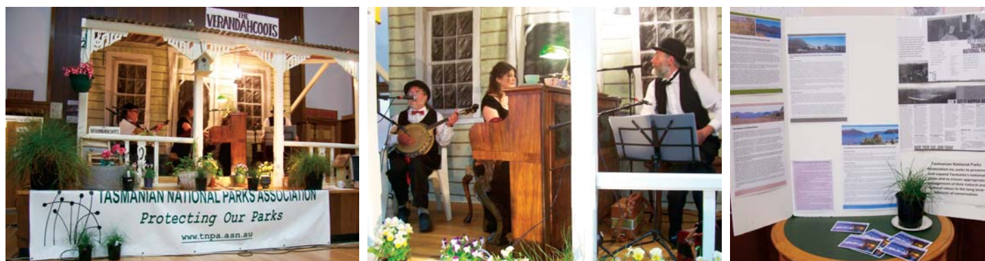
L-R: The Verandah; the VerandahCoots; TNPA display on the Overland Track.